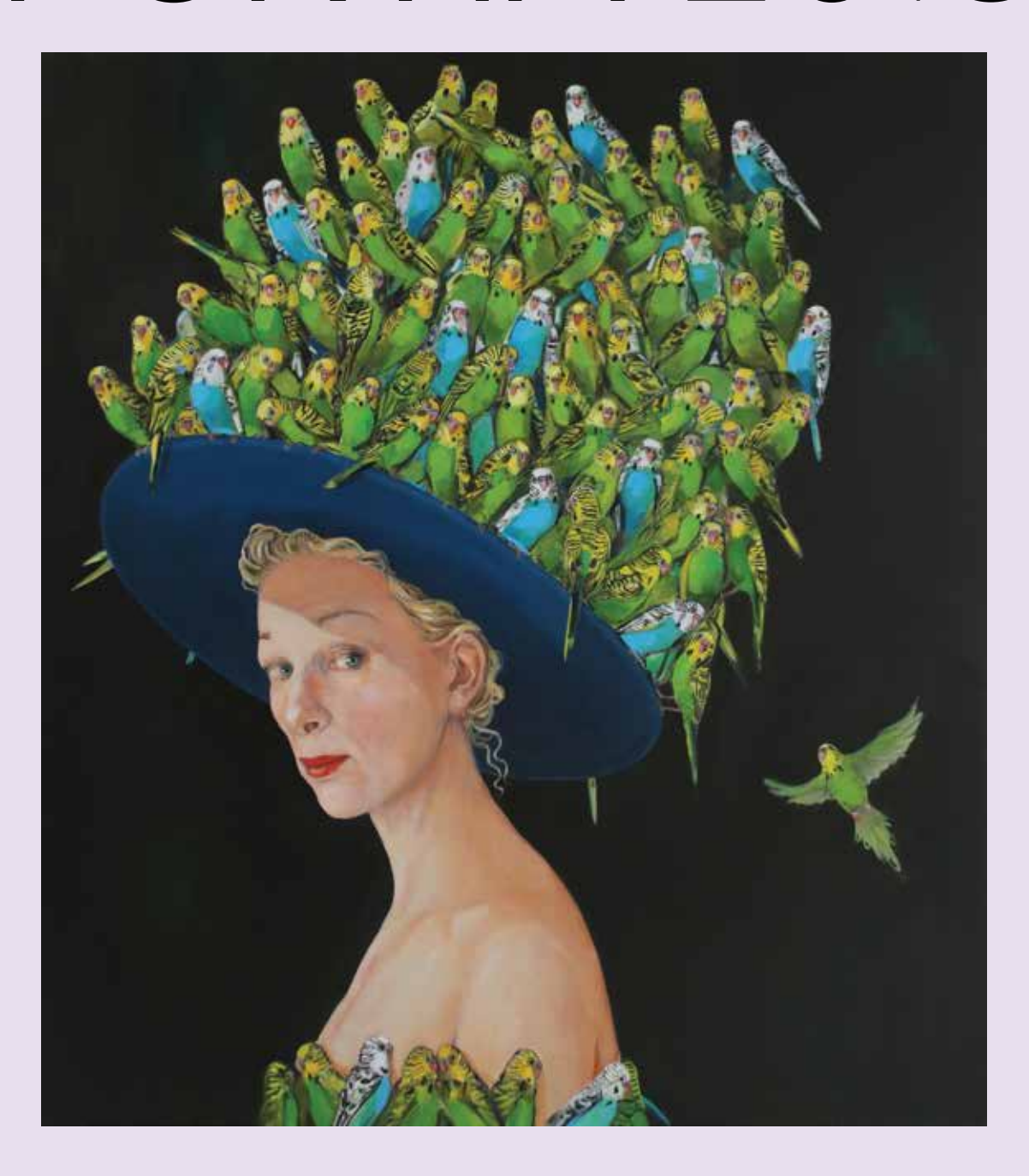
The annual journal and report of Victorian Women Lawyers